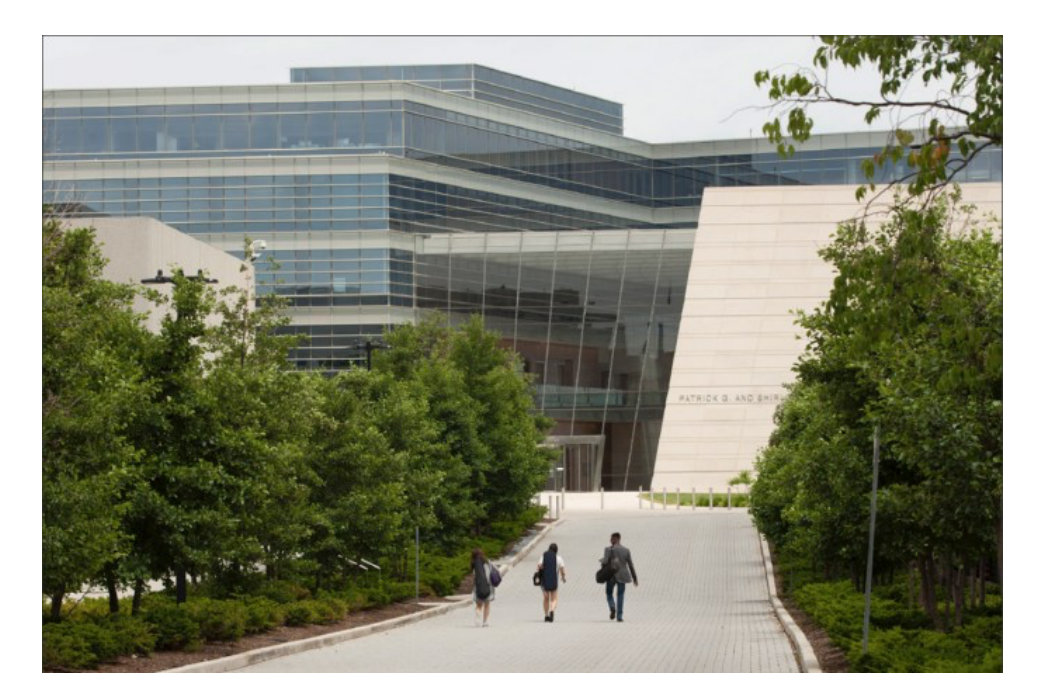
The Ryan Center for the Performing Arts.

In contrast, and by way of demonstrating the variety of Design Evanston Award winners in 2017, a project in the New Construction category was the Ryan Center for the Performing Arts on the Northwestern campus. The jurors said, "Guided by the university's master plan, the building forms a new quadrangle with other fine and performing arts facilities, fostering a more collaborative arts community."