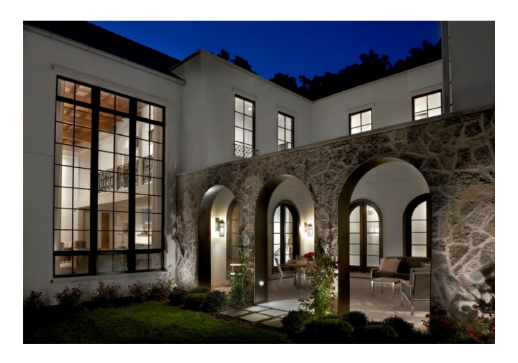
The residence at 1331 Asbury Ave. Credit: Searl Lamaster Howe

In contrast, and by way of demonstrating the variety of Design Evanston Award winners in 2017, a project in the New Construction category was the Ryan Center for the Performing Arts on the Northwestern campus. The jurors said, "Guided by the university's master plan, the building forms a new quadrangle with other fine and performing arts facilities, fostering a more collaborative arts community."